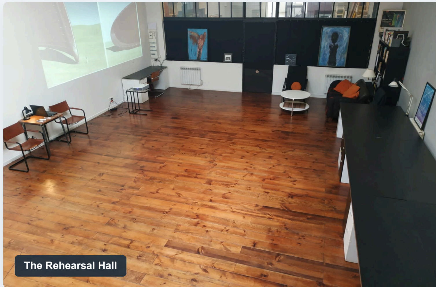
The Rehearsal Hall